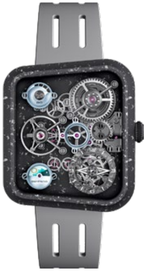
BEHRENS PUPIL ULTRALIGHT 8G