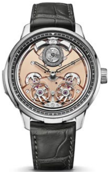
ARMIN STROM MINUTE REPEATER RESONANCE FIRST EDITION 12:59