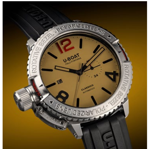
U-BOAT CLASSICO POLARIZED DARK MISTEY