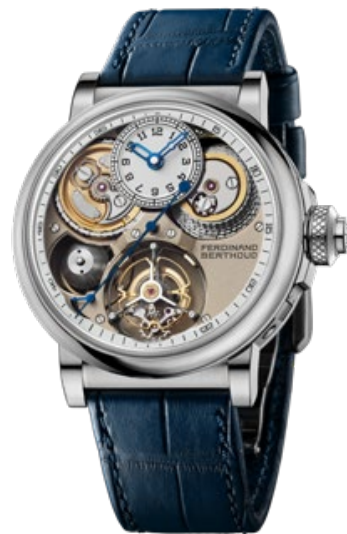
FERDINAND BERTHOUD MESURE DU TEMPS 1787 CHRONOMÈTRE FB 2TV.1