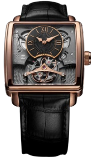
RUDIS SYLVA RS 11 HARMONIOUS OSCILLATOR