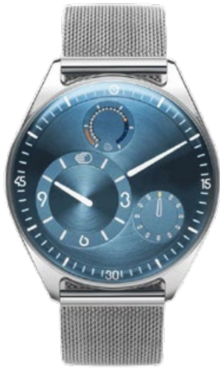
RESSENCE TYPE 11