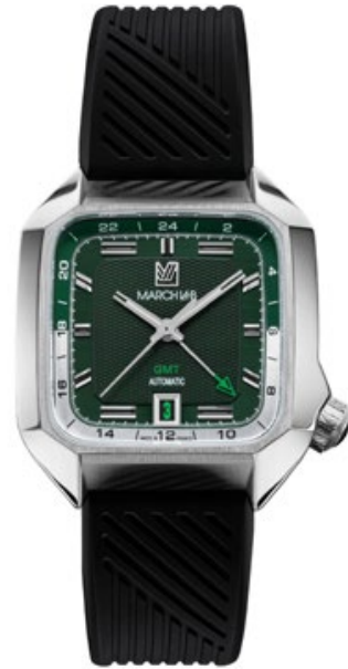
MARCH LAB AM2 XS GRALL