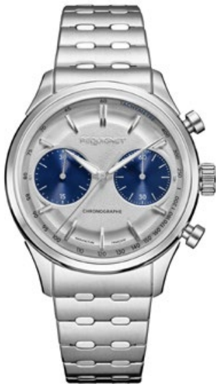
PEIGNET ROYALE PARIS CHRONO