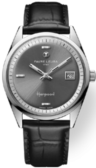
FAVRE-LEUBA HARPOON REVIVAL