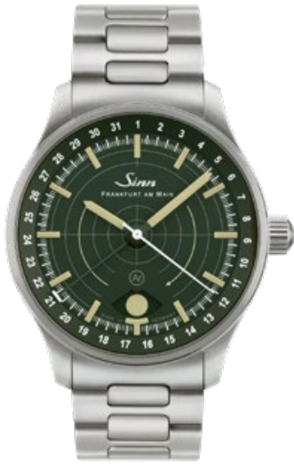
SINN 308 HUNTING WATCH