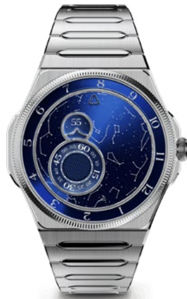
TRILOBE SECRET EDITION