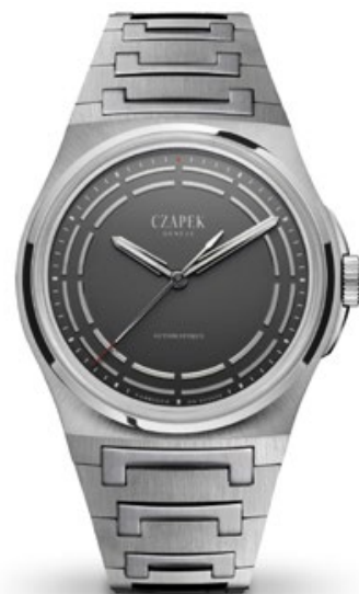
CZAPEK & CIE ANTARCTIQUE S TITANE DARK SECTOR