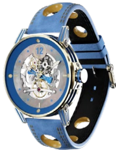
BRM V6-42-EV MOON MASTER