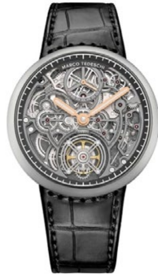
KROSS STUDIOS MT1.1 LE TOURBILLON 7 JOURS