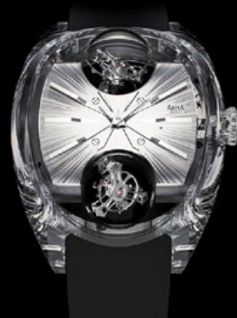
ARTYA GENÈVE COMPLEXITY