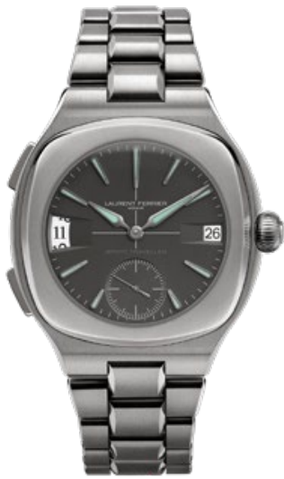
LAURENT FLEURIER SPORT TRAVELLER