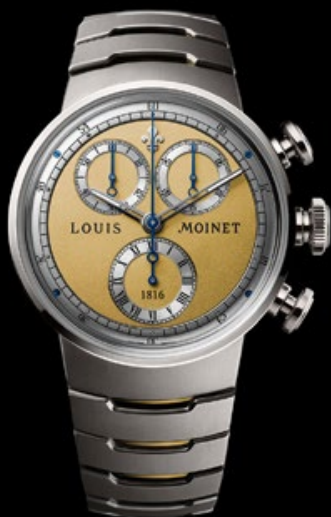
LOUIS MOINET 1816 CHRONOGRAPH CHAMPAGNE EDITION