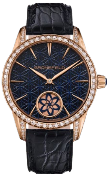
GRÖNEFELD 1944 TANFANA