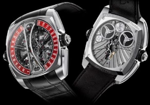
CYRUS GENEVE KLEPCYS VERTICAL TOURBILLON JASPER