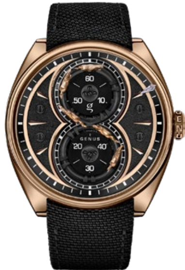
GENUS GNS2 ETERNAL GALLOP