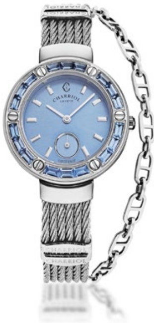
CHARRIVOL ST TROPEZ HAUTE-COUTURE