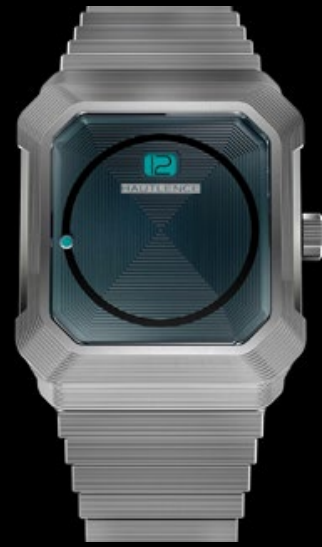
HAUTLENCE KUBERA JUMPING HOURS SERIES 1