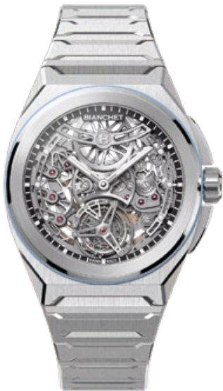
LOUIS MOINET 1816 CHRONOGRAPH CHAMPAGNE EDITION