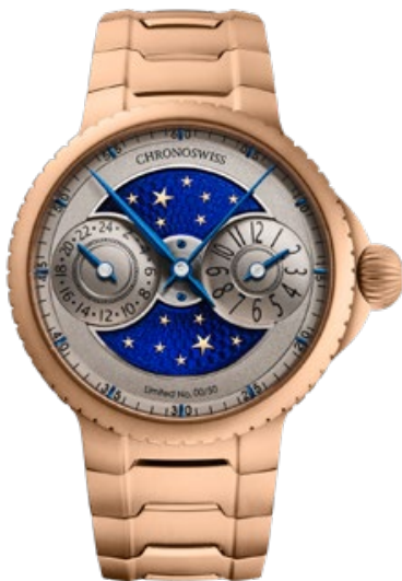
CHRONOSWISS PULSE GMT ENAMEL SKY GOLD