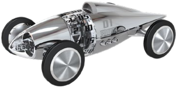
L'ÉPÉE BELLY TANK RACER